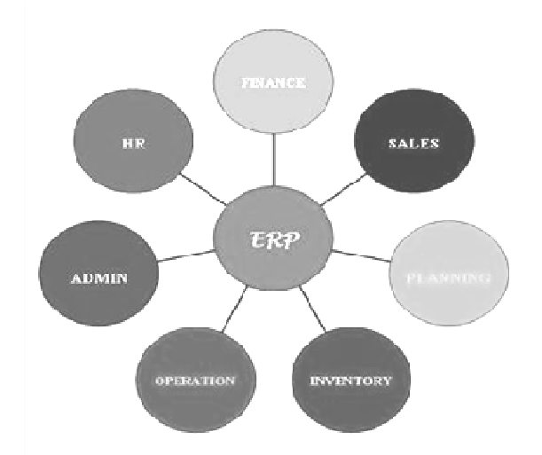
Figure 1 Components of an ERP system

In order to achieve a faultless integration, an ERP system uses multiple hardware and software components. Intended to ease the administration and optimization of internal business processes across a corporation, ERP packages have become the competitive tool for most large trade organizations. ERP software uses a single database allows the different departments communicate with each other through sharing the information. ERP systems comprise functionspecific components that are designed to interact with the other modules such as the Order Entry, Payable, Accounts Accounts Receivable, Purchasing, Distribution etc.