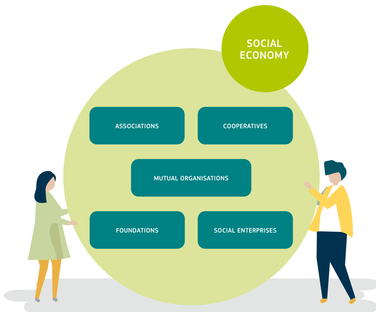
Figure 1. The social economy at a glance

Another form of cooperatives, platform cooperatives , offer new solutions for cooperation among workers, producers and consumers. Platform cooperatives are cooperatively owned, democratically managed enterprises that use an online platform and a website, mobile app or a protocol to facilitate the sale of goods and services. Platform cooperatives work on the basis of principles such as transparency, co-ownership, cooperation and solidarity. They also offer workers an innovative ownership model (see page 33).