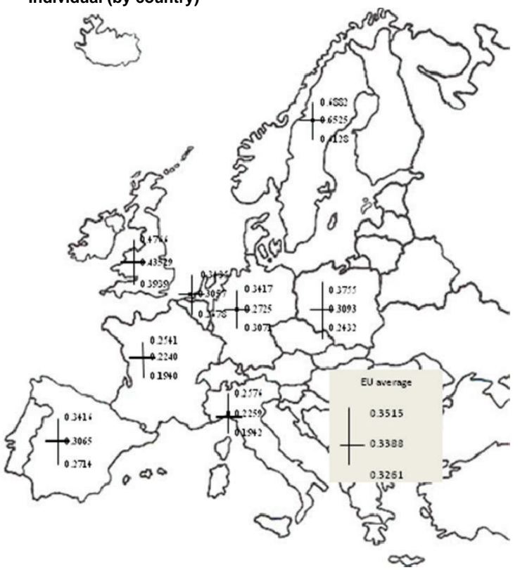
Figure 1 Predicted Probability of Saving for Retirement for a "European Average" Individual (by country)