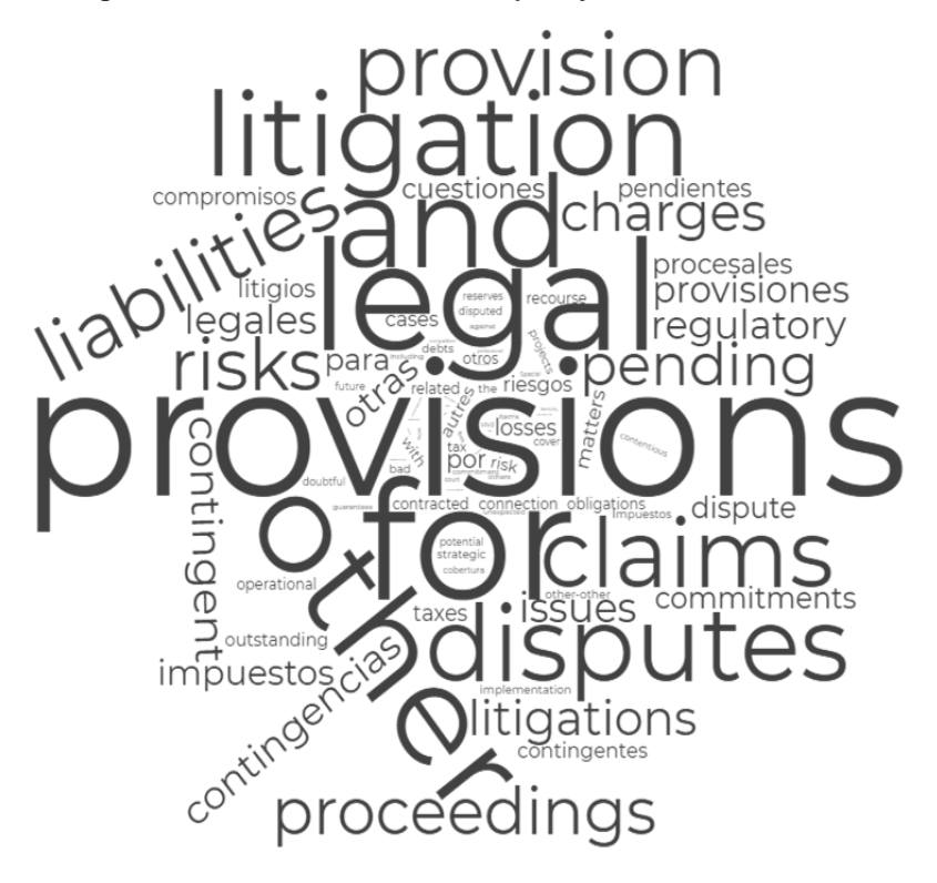
Figure 1 Legal Provisions Literal Account Frequency

We control for the following firm-level issues: ROA measures a company's operating performance and is calculated as EBITDA divided by total assets. MB is the equity market to book ratio (Adam and Goyal 2008). SIZE is a measure of the size of the bank as the logarithm of total assets. LEV is the leverage calculated as total liabilities over total assets. ZSCORE is a measure of risk that captures the probability of a bank defaulting as the distance to insolvency. It compares capitalization and returns with the volatility of those returns. As shown in the appendix, it is measured as the return on assets and the weight of equity over assets, both divided by the standard deviation of the return on assets (Boyd, Graham et al. 1993; Boyd, De Nicolò et al. 2006; Zigraiova 2015). TIER1 is the ratio of Tier 1 capital as a percentage of total risk-weighted assets. The ratio represents high-quality sources of capital that banks and other financial institutions are required to keep in order to be protected against bankruptcy. It is also referred to as the core capital ratio, or as the going-concern capital ratio.