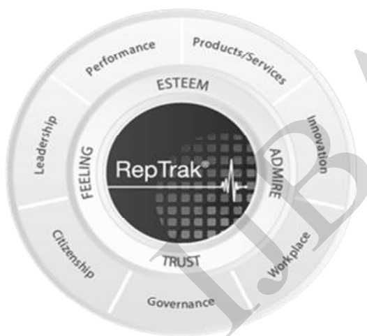
Fig. 2. Model of Corporate Reputation [1]

Reputation Institute [1] defines a set of seven major factors affecting corporate reputation, namely products, innovation, workplace, governance, citizenship, leadership, and finally, performance and results of a company, collectively forming the model of corporate reputation - RepTrak, as the graphics shows. It is a model and system of regular measurement of reputation of global corporations developed by Reputation Institute, a company researching reputation.