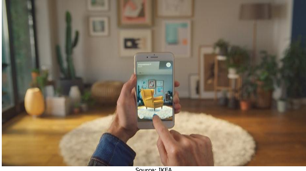
Figure 1 IKEA Mobile Application