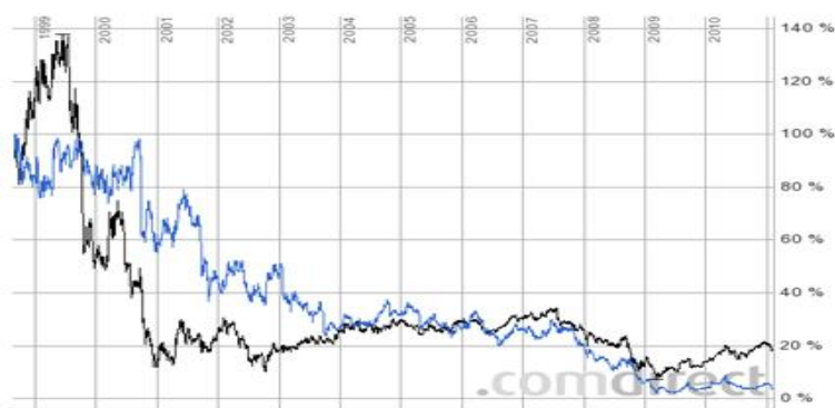
Figure 1. Stock market development of Xerox (black) and Kodak (blue) between 8/1998 and 2/2011

As can be derived from fig. 1, Kodak lost more than 95% and Xerox close to 70% of its respective share value in the time from 1999 to 2010. The value destruction process at Xerox of almost 80% of its value took approximately 1.5 years (1999-2001), while Kodak lost 60% of its value in 3 years. Despite the fact that the trend towards digital technology and products was definitely evident to both companies for more than 10 years, neither developed a successful strategy in the period of 1990-2000. The fast growing internet business witnessed around 1997/98, however, drastically revealed to world the two big weak spots of these companies: pictures did not require films any longer but SD-cards and documents could be transmitted between computers and printed using the PDF format.