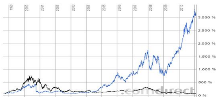
Figure 2. Stock market price development of Apple (blue) and Nokia (black) between 1999 and 2/2011

According to traditional strategic thinking, it is very unlikely that a company starting with rather small quantities of mobile phones can gain a strategic edge against a competing world market leader. This raises the question of how Apple was capable of eventually surpassing Nokia and which key mistakes Nokia made. Clearly Nokia did not fully comprehend that the transition from the 2G voice centric (GSM) to the 3G (UMTS) data centric technology represents not a linear but a disruptive event. In the 2G world, data played no significant role. This changed with the introduction of the 3G technology. Nokia wanted to essentially engineer a mobile phone with improved data capabilities, while in sharp contrast hereto Apple defined 3G devices as a market for highly portable computing devices with add-on voice capabilities.