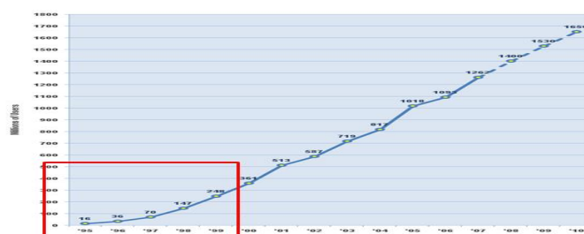
Figure 5. The development of worldwide Internet Users 1995-2010

The large incumbent European competitors reacted much later. Again, the specific tools employed in the strategy process were not able to adequately forecast the disruptive nature of this development, which led to complete transformation of the European airline market. In stark contrast hereto, Ryanair understood the strategic potential of the internet technology immediately and used the first-mover advantage to the fullest. By 2009, Ryanair overtook the leading German airline Lufthansa by number of passengers.