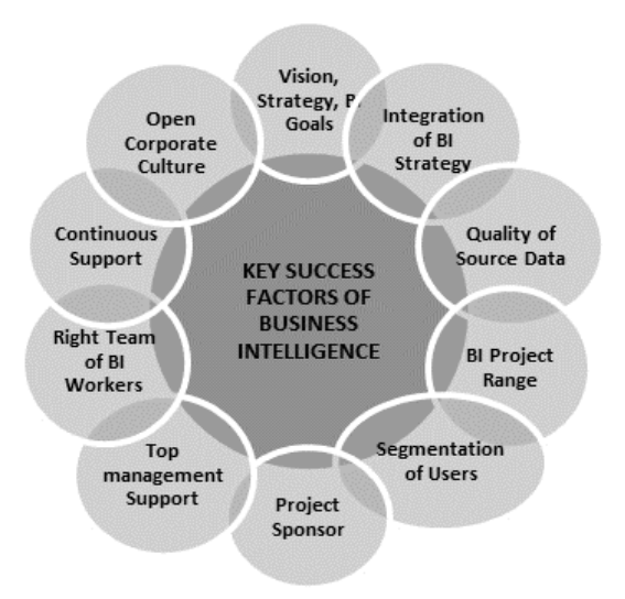
Figure 3 - The newly established model of key success factors of Business Intelligence

Confirmation of hypotheses and interdependence of the extension of the original model as follows: