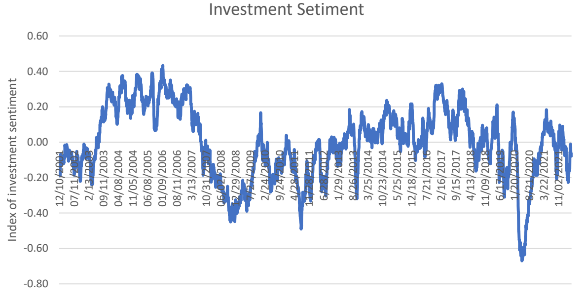
Figure 2: Investment Sentiments.

Interestingly, the study seeks to investigate the role of investors' sentiments in the efficiency behaviour of the exchange rate. News sentiments are the sentiments professed by investors during their portfolio balancing decisions, hence, otherwise known as investment sentiments. As depicted in Figure 2, the investment sentiments are well suited as the investors became most pessimistic during the periods of the global financial crisis of 2007 – 2009 and the COVID-19 global pandemic. Investors cast a more pessimistic view during the period of the global pandemic. As there was to be a ray of investment optimism by October 2021, but this was short-lived as the investment sentiments reclined again in November 2021 and since March 2022 (see Figure 2).